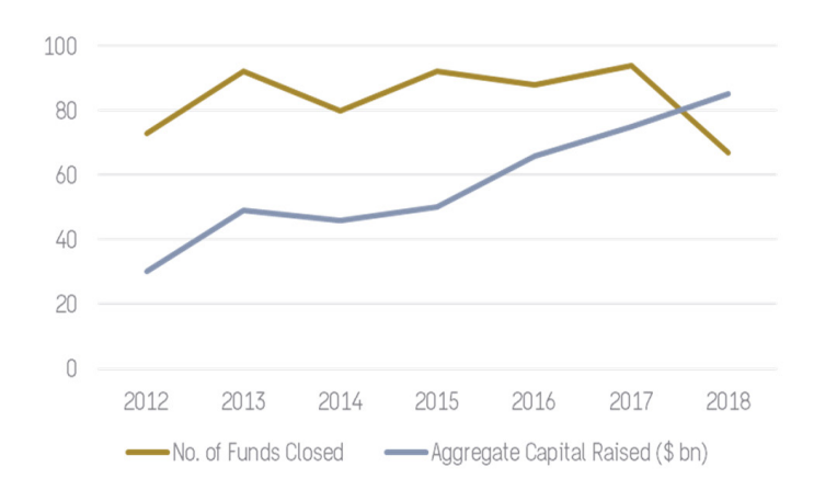
Figure 3. Global capital raise for closed end, non-listed infrastructure funds.

The infrastructure market is popular among investors. There has never been so much invested in infrastructure as in 2018. In 2018, unlisted infrastructure funds raised approximately \[mathbb{e} 75 billion in capital ($ 85 billion, see Figure 3). In addition, funds still have a lot of money on the shelf, more than \[mathbb{e} 150 billion. That is why Sweco Capital Consultants expects again historically high investment volumes in infrastructure in 2019. In January 2019, a total of 208 funds are open for investments. These funds have a total target size of approximately \[mathbb{e} 170 billion in equity.